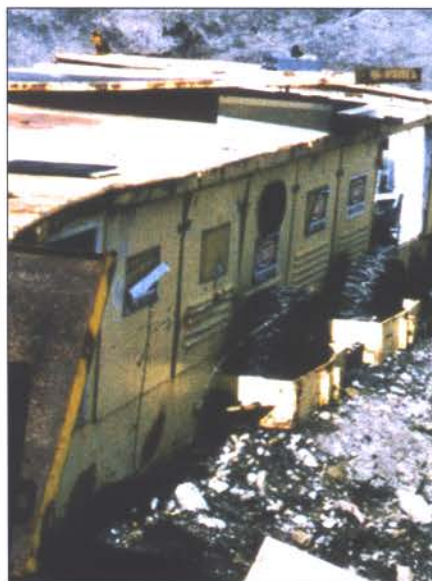
Mine Power Center Commonly Containing Capacitors

The physical and chemical properties that make PCBs valuable commercially also make them environmentally detrimental. PCBs are very stable compounds which resist breakdown from high temperatures and aging. Once in the environment PCBs persist for long periods of time: they can easily cycle between air, water, and soil 13 ; they are orders of magnitude more fat soluble than water soluble and tend to concentrate in fatty tissues.