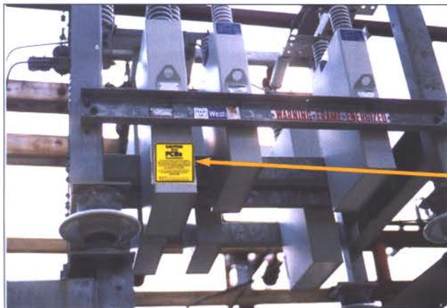
Looking up at PCB Marked Capacitor on the left (graphic below)